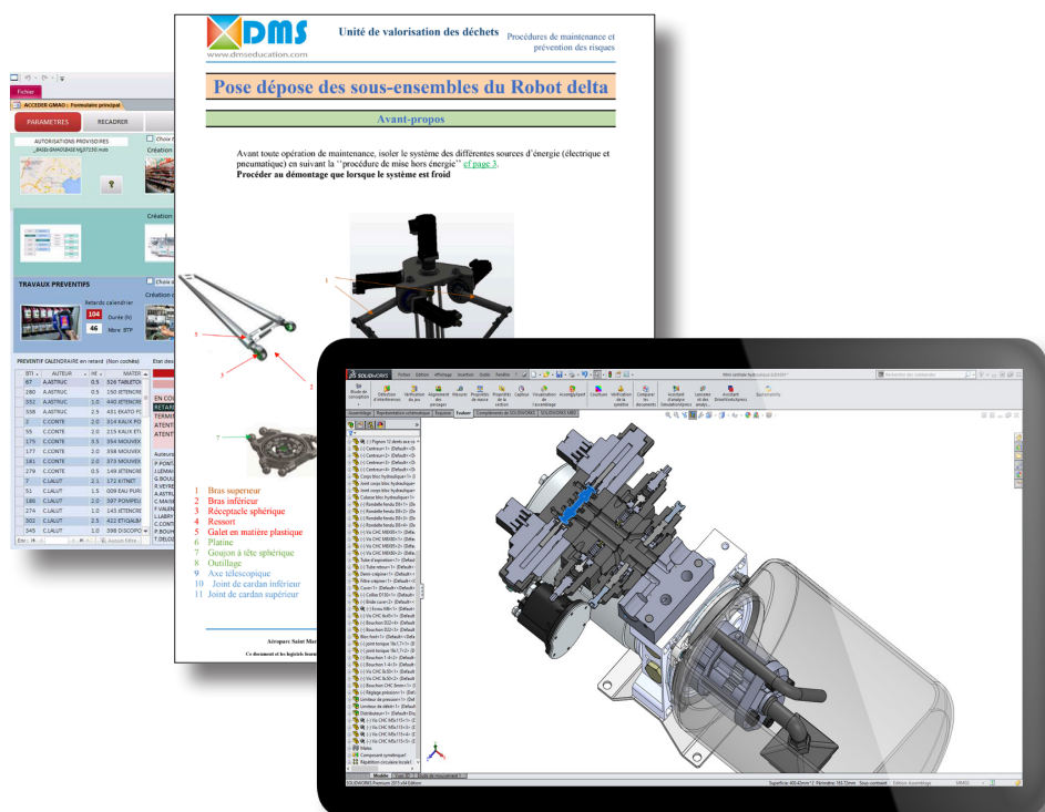
CMMS, Maintenance guides & 3D model