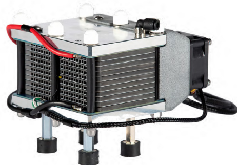
Hydrogen fuel cell PRAGMA INDUSTRIES