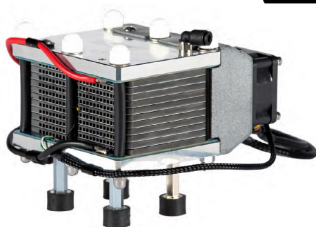
Hydrogen fuel cell PRAGMA INDUSTRIES